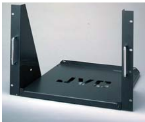
RK-C1700E ■ EIA Rack Mount Adapter